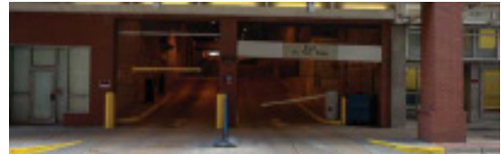
6th Street entrance to the St. Louis Centre Garage