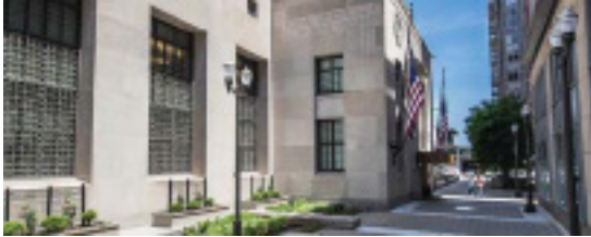
Entrance to the St. Louis Fed